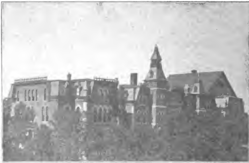
STATE NORMAL SCHOOL. EMPORIA.